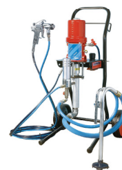
Spray Systems and Accessories