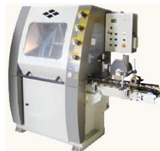
Finishing Machinery and Systems-new and used